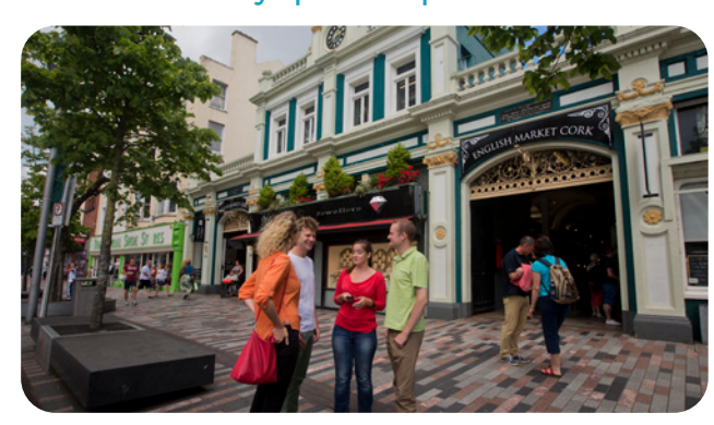
You want to meet likeminded international students from all over the world!

You want to experience the best of Ireland with lots of activity options to pick and choose.