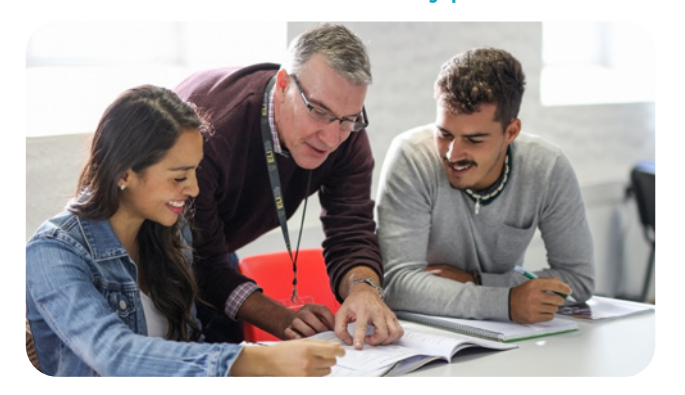
You want an international learning experience and to develop and grow.

You want to improve your English but are flexible on study period.