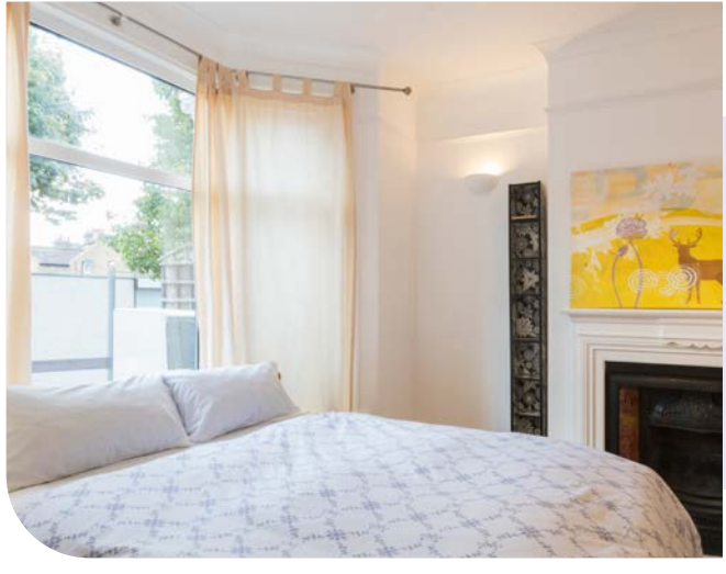
Example of a homestay room

We also work with trusted homestay providers to deliver a quality experience that ensures you are safe, comfortable, and happy with your host.