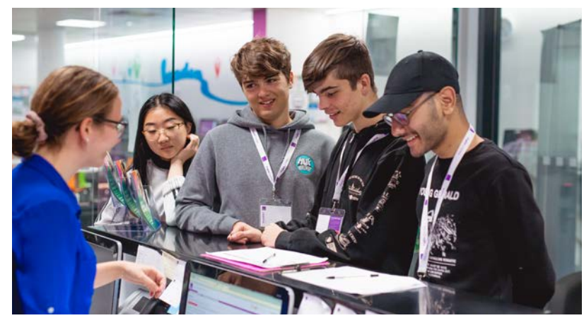
The London Centre's reception

With a wide selection of on-site amenities, our London school offers more than just English learning: it is a place for recreation and enjoyment too. Lessons at our British Council accredited school take place in our fully air-conditioned, bright, and modern classrooms. Students can socialise in our spacious student area, and study in the free public library* or our self-study centre. There is free Wi-Fi throughout the school and an on-site library, allowing students to learn and entertain themselves outside of lesson times.