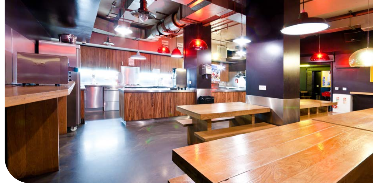
A common dinning area in a residence