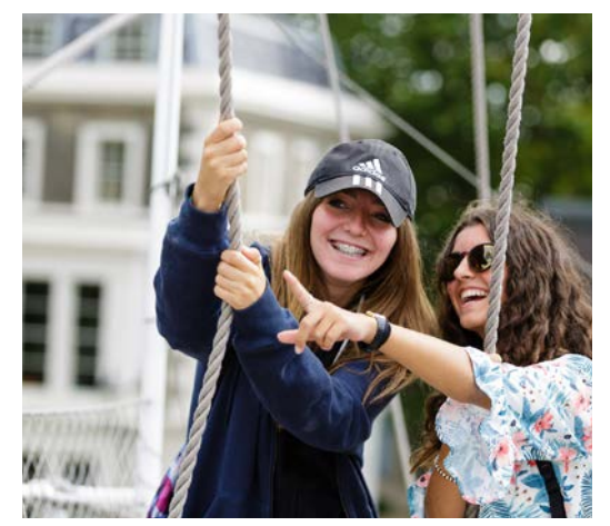
Aboard the Cutty Sark, Greenwich