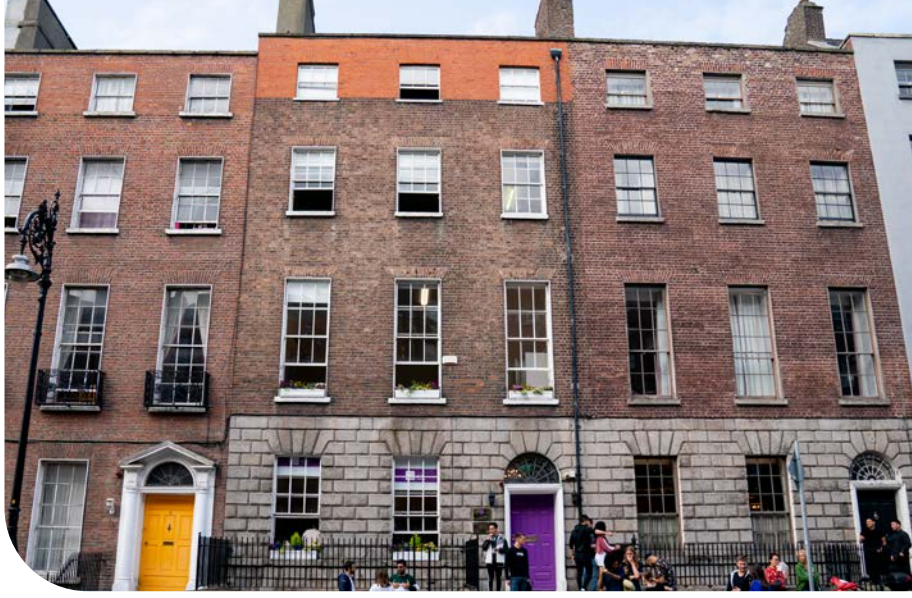
The Dublin Centre at North Great George's Street

We can tailor packages for any specific purpose or sector upon request.