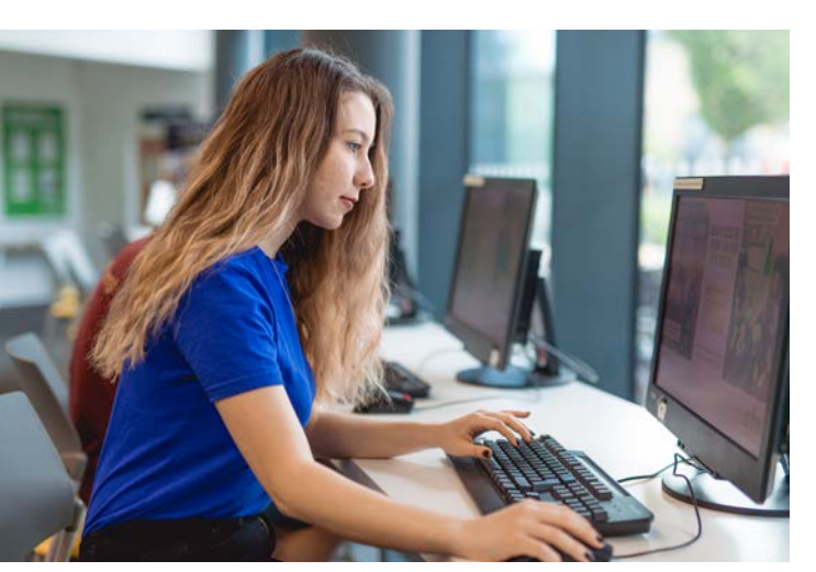
Using the public library at the London Centre

All our courses have a communicative teaching approach, as well as being supported by project work. This teaching method helps you learn English as well as more about British or Irish culture. Lessons are partly task/project based with students and teachers working together to improve fluency, accuracy, and understanding.