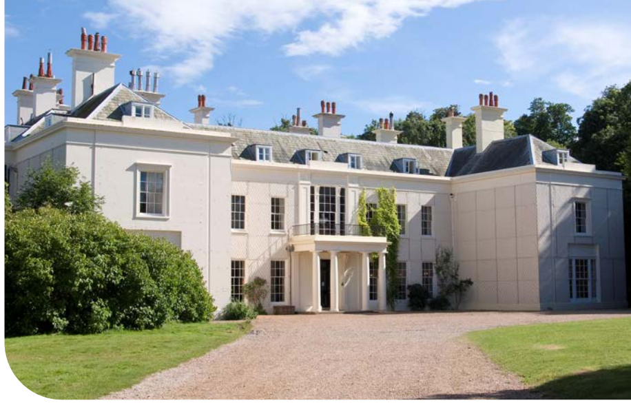
The Fastbourne Centre

Our school is set in ten hectares of private grounds. It is located just 15 minutes from the centre of Eastbourne, and it is close to the South Downs National Park, Beachy Head, Seven Sisters, and Cuckmere Haven.