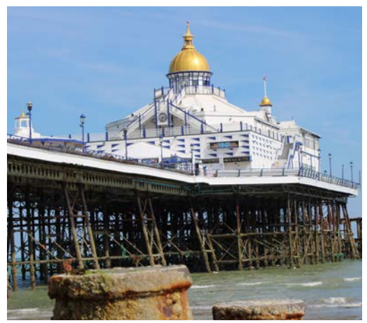
The Eastbourne seaside pleasure pier