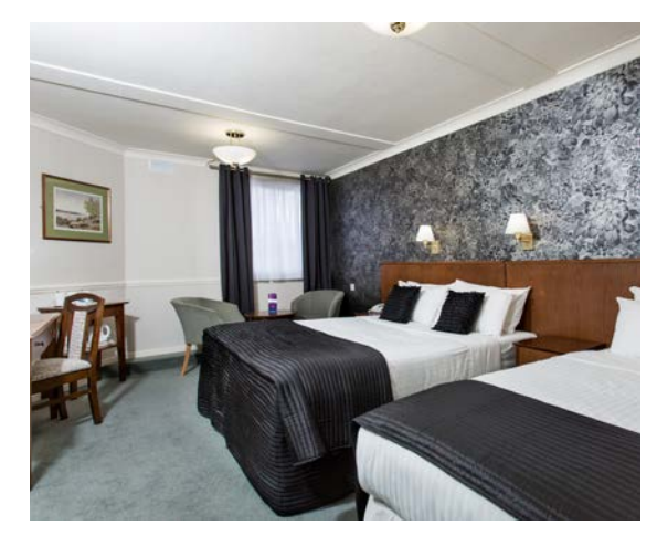
Example of a hotel room

Hostels are the ideal alternative if you who want to share with other young people in a relaxed atmosphere, whereas hotels can offer you more comfort and privacy. We partner with several quality hotels and hostels across the UK and Dublin, offering a range of options for a relaxing stay. Hotels are also ideal for group leaders or small groups of students.